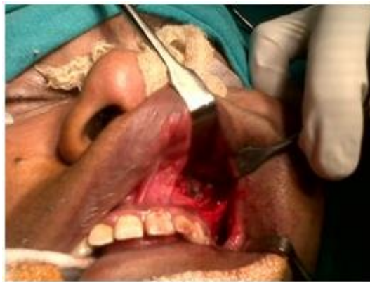
Fig-2 Caldwell-Luc's Surgery showing brownish mass in maxillary antrum