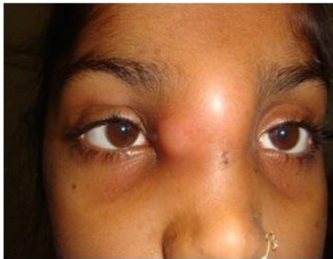
Fig-2 cellulitis associated with punctum