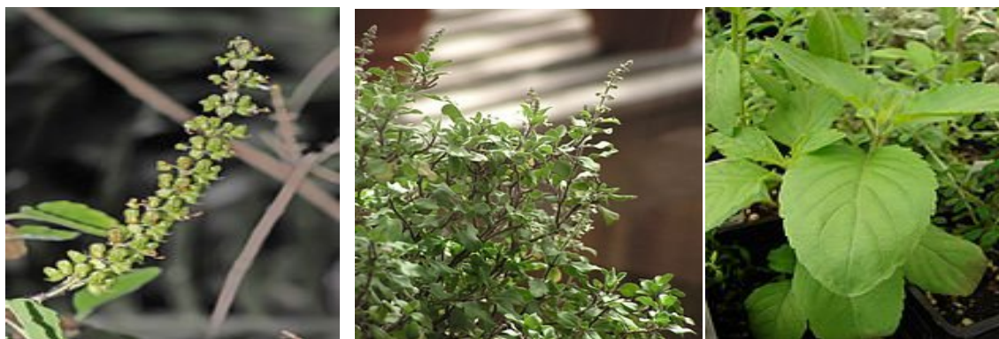
Figure 1: Photographs of plants belonging to Genus Ocimum

The word ocimum have a strong impact in the Asian subcontinent. This category has attained spiritual [1] as well as the respectful position in comparison to other herbal plants. Tulsi, the Queen of herbs, the legendary ‘Incomparable one’ of India, is one of the holiest and most cherished of the many healing and healthy giving herbs of the orient.